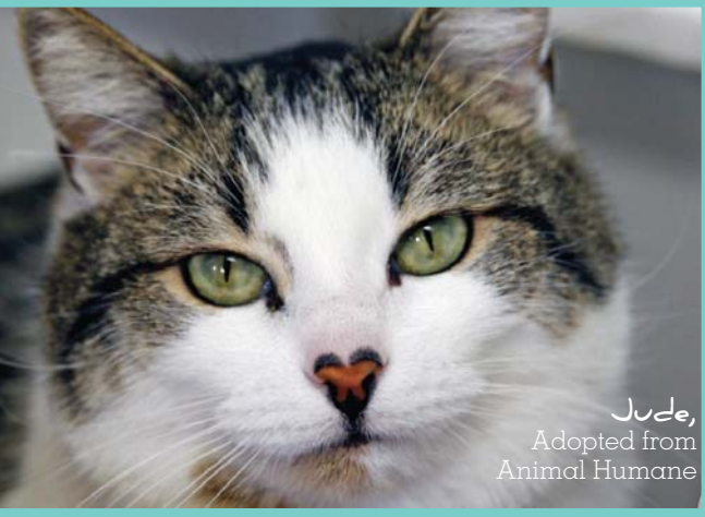
Jude, Adopted from Animal Humane