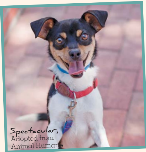
Spectacular, Adopted from Animal Humane

The Albuquerque community has achieved an overall Live Release Rate (LRR) of 82.8%. LRR is total dog and cat intakes divided by the total number of pets leaving our shelters alive. To put our LRR in perspective, the LRR for New Mexico shelters combined is only 51%. The goal of our partnership is to increase Albuquerque's LRR to 84.8% by introducing new programs to reduce shelter intakes, increase adoptions and increase reuniting lost pets with their owners. By improving our programs in Albuquerque, we will be able to share lessons learned with our peers at other