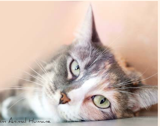
Georgie Girl Adopted from Animal Humane