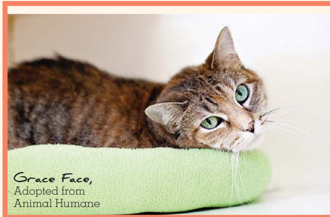
Grace Face, Adopted from Animal Humane