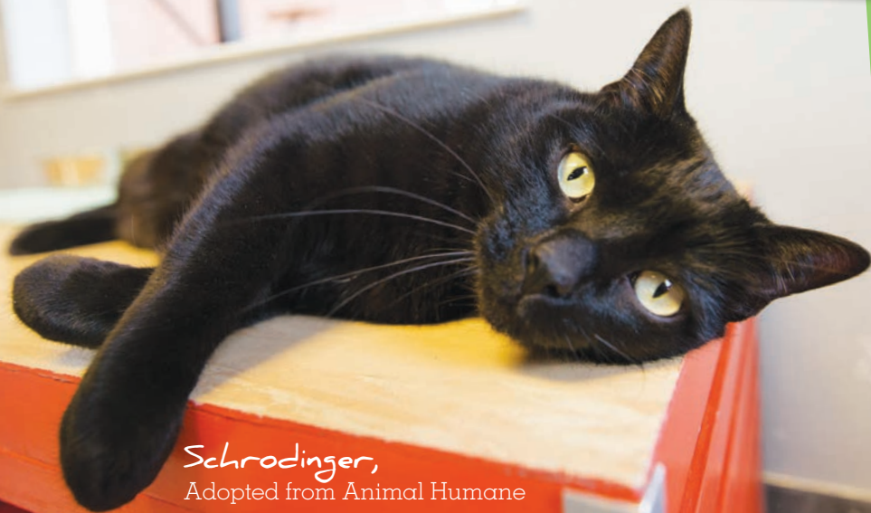
Schrodinger, Adopted from Animal Humane

Please call 505.938.7915 for more information or to schedule a FREE pickup of large furniture donations.