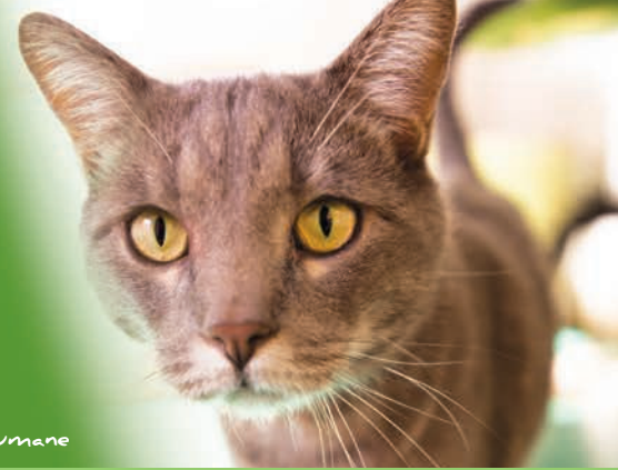
Sawyer, Adopted from Animal Humane