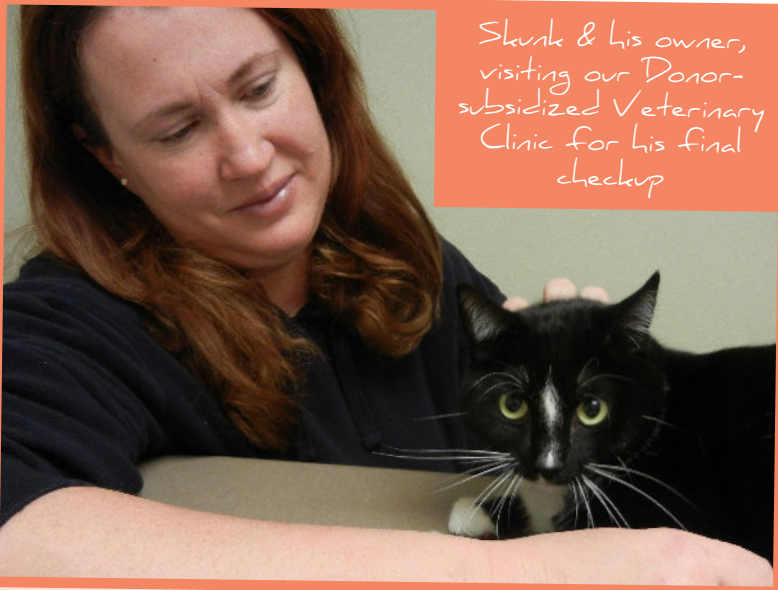
Skunk & his owner, visiting our Donor- subsidized Veterinary Clinic for his final checkup