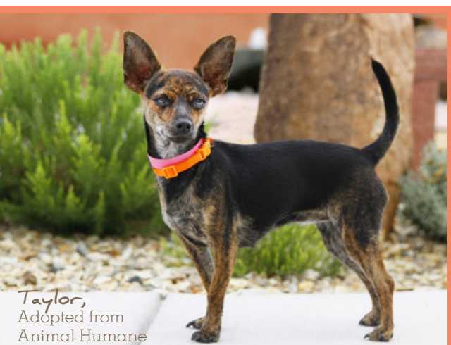
Taylor, Adopted from Animal Humane