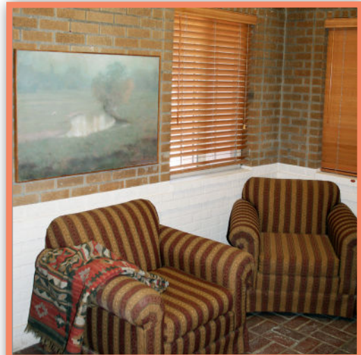
One of our new Comfort Rooms in our newly-expanded Donor-subsidized Veterinary Clinic

Our clients will experience peace and privacy when it is time to say goodbye to their beloved pets.