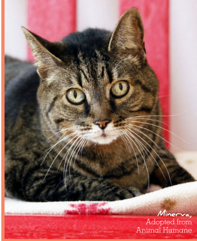
Minerva, Adopted from Animal Humane

* In our recent Winter 2015 edition, we reported the wrong end-date for our honorarium & memorial list. The correct dates were July 1, 2015 – September 30, 2015.