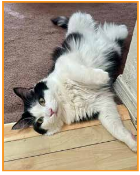
Squish is the star at his new home! He loves snuggling with his two canine siblings.

Want your adopted pet to be potentially featured in an upcoming newsletter? Scan the QR code to send us a PUPdate and CATchup! Send any images to pupdate@animalhumanenm.org.