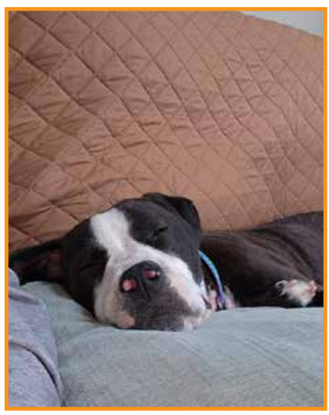
Drew is living the good life with his new family. He loves lazing on the couch and is learning how to jump in the car!