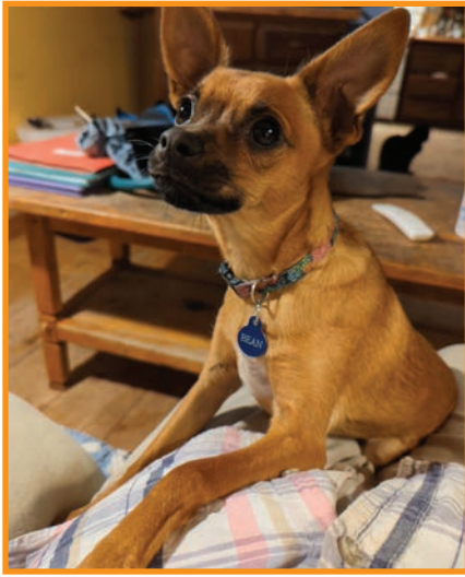
Bean is all ears in his forever home. He's even learned how to bay from his Coonhound brother. .....