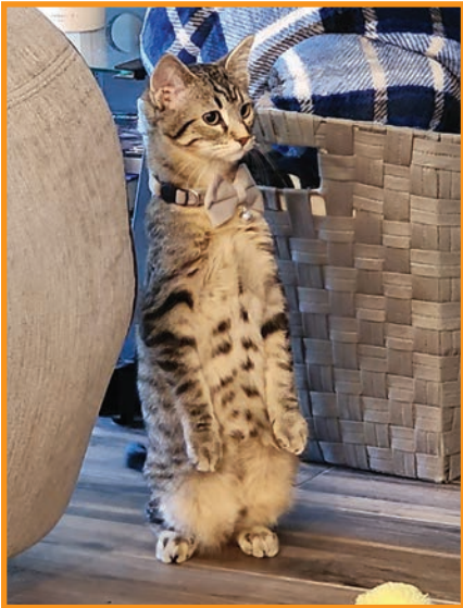
Gojo models his bowtie for his family. His adopter said, "He has been a wonderful blessing." .....

Want your adopted pet to be potentially featured in an upcoming newsletter? Scan the QR code to send us a PUPdate and CATchup! Send any images to pupdate@animalhumanenm.org .