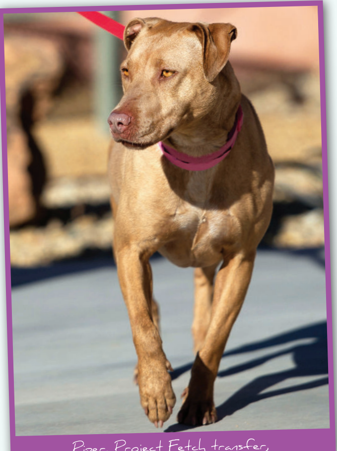
Piper, Project Fetch transfer, Adopted From Animal Humane

Project Fetch allows Animal Humane to rescue at-risk pets from across our state. The program sprung forth because we recognized that partnerships with shelters in our metro area, and well beyond the borders of central New Mexico, would save more lives. In 2009, Animal Humane transferred in 750 at-risk pets throughout our state. By 2015, this count grew to nearly 1,700 (a 125% increase) with 70% of these pets coming from rural New Mexico communities in tremendous need of support .