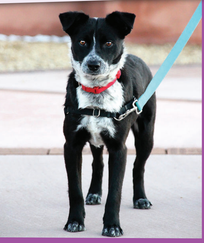
Allie, Adopted from Animal Humane