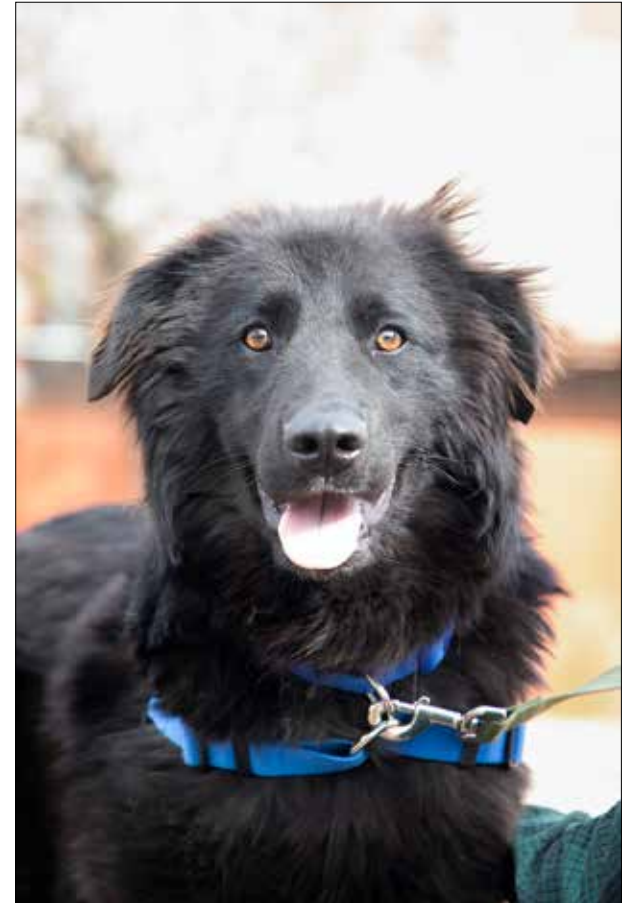
Blackberry, Adopted from Animal Humane

In order to direct more funding to the pets & people who need it most, we have listed all our lifesaving donors digitally! Just scan the QR code.