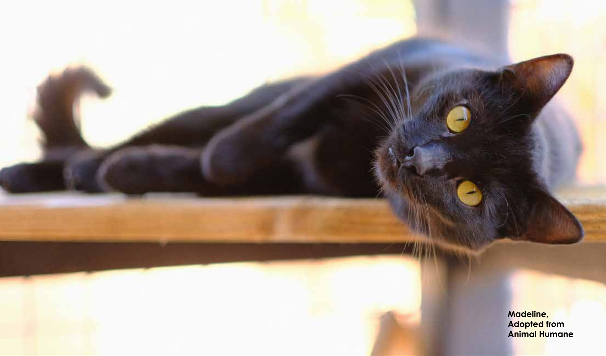
Madeline, Adopted from Animal Humane