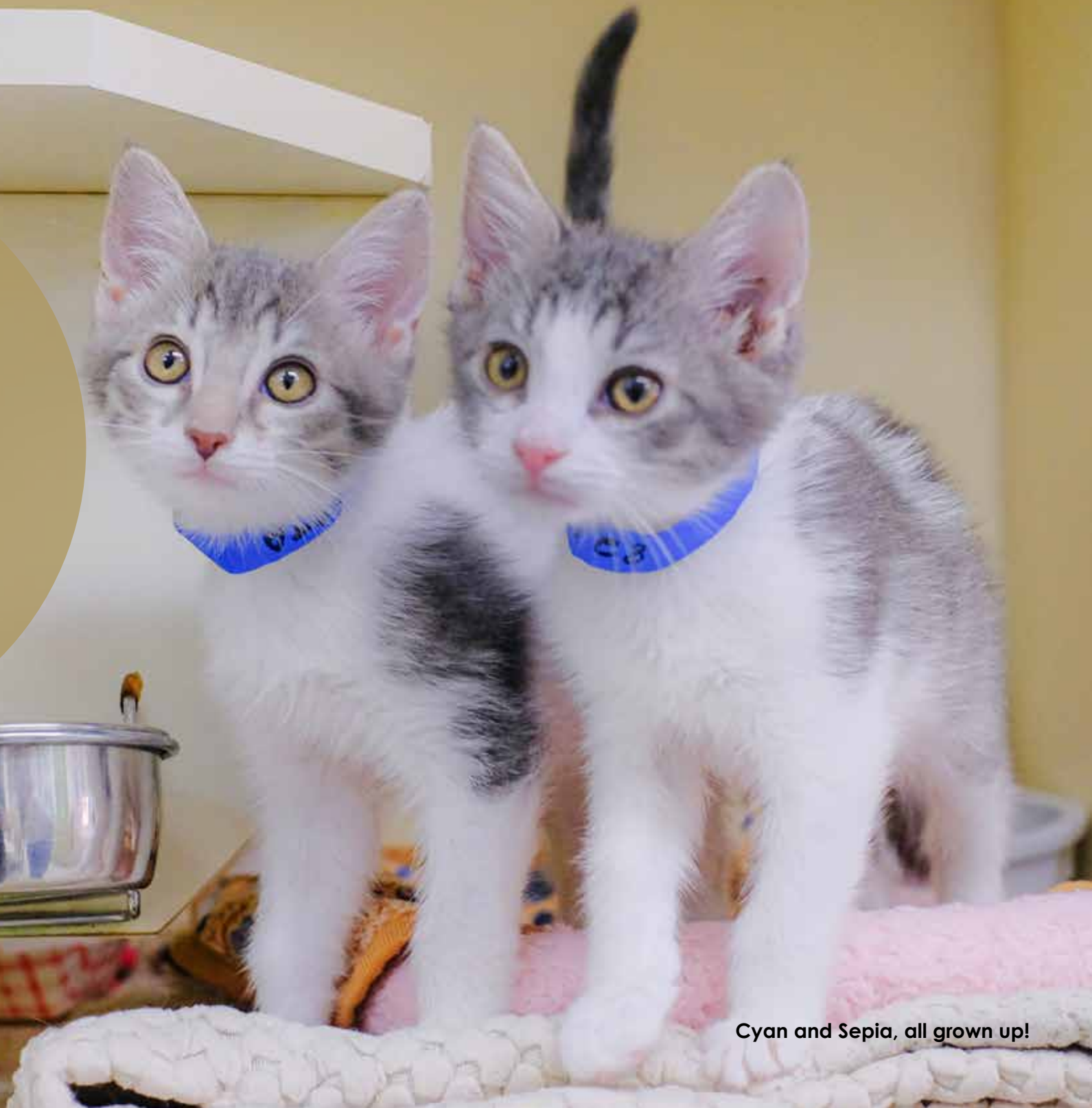
Cyan and Sepia, all grown up!