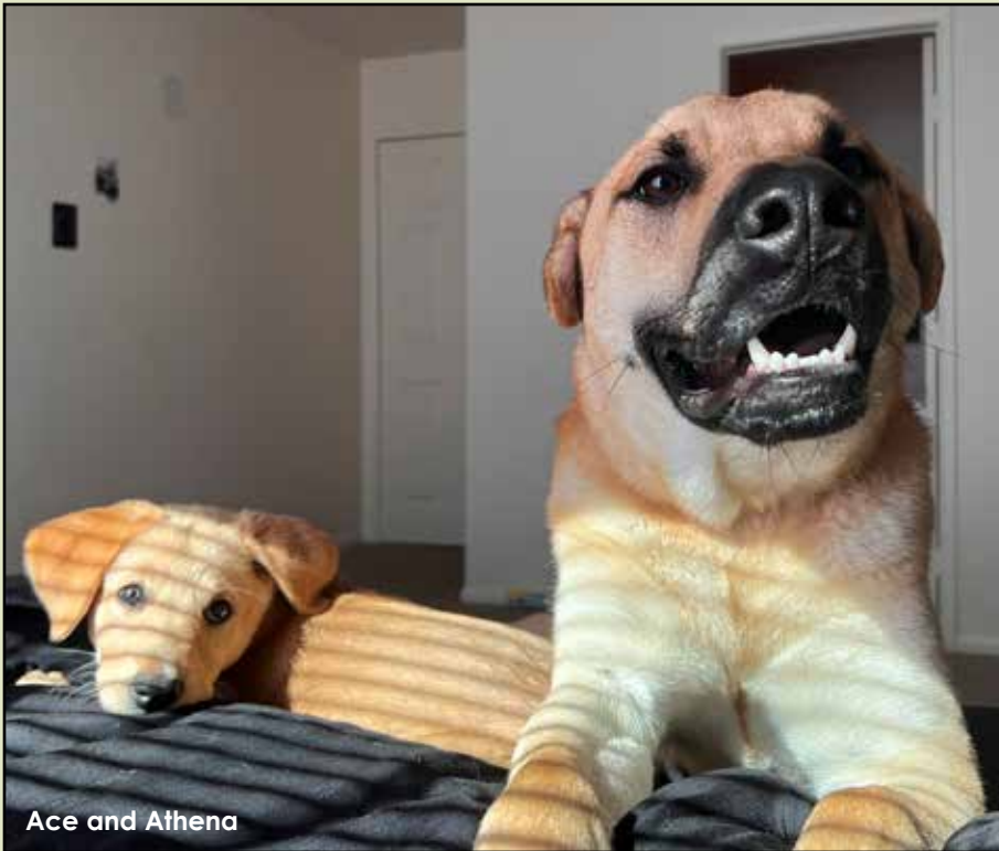
Ace and Athena

energy skyrocketed, especially around other dogs.