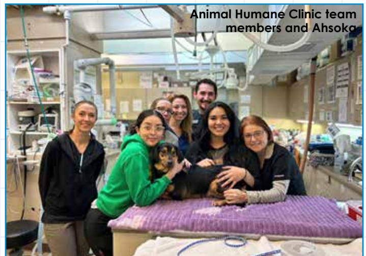
Animal Humane Clinic team members and Ahsoka