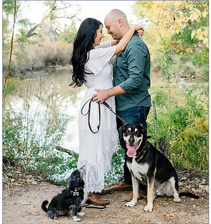
The new family of four.