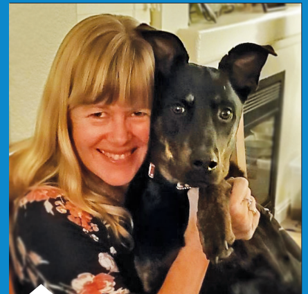
Koda Bear was rescued last February & turned 1 in December. I'm lucky to have him! 🐾❤️