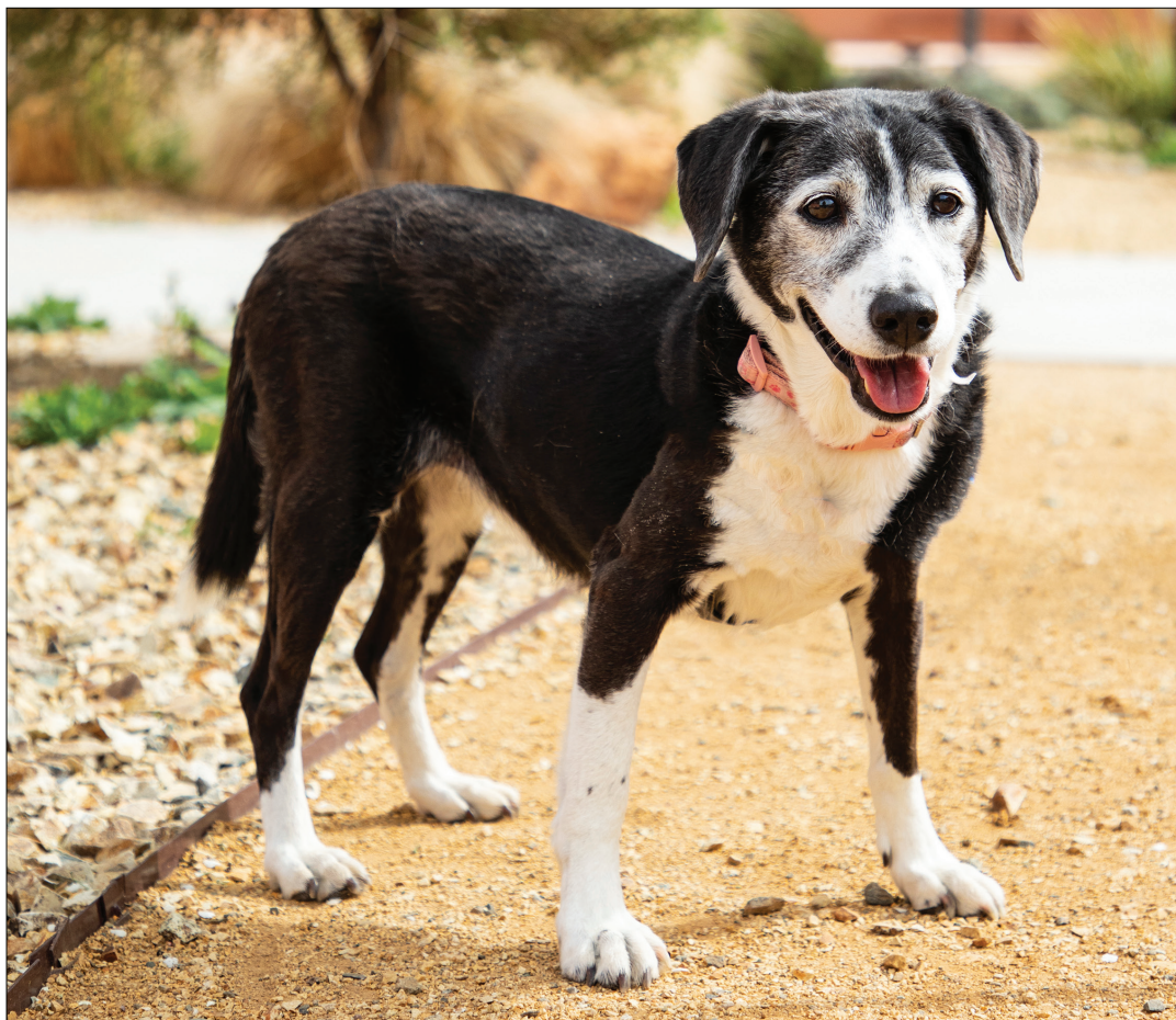
Matilda ready to enjoy her golden years.

Late one night in early spring when the temperatures were still dipping to freezing Matilda, a deaf senior Beagle mix, was found wandering down the road in a small town south of Albuquerque. Evidence of a hard life was written across the 10-year-old's body , and she communicated it to our Team with every wobbling step.