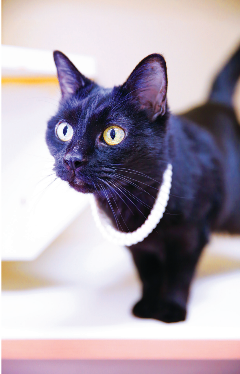
You're never too old for love or pearls. Celine was adopted at 14-years-old.

Obesity in senior pets increases the risk of health problems. Keep your pet in shape with a healthy & readily digestible diet & maintain an age appropriate exercise regimen.