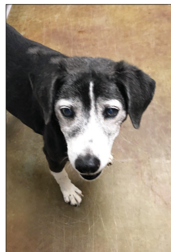
Matilda when she arrived at Animal Humane

Thank you for believing in these senior pets & making their futures bright.