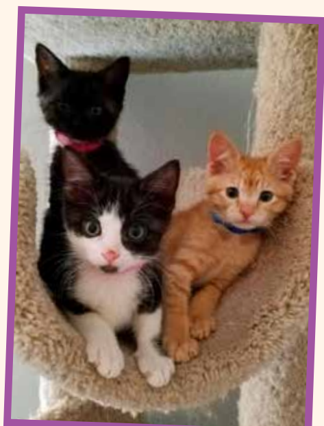
Gundrop, Gunny Worm & Gunny Bear

That's why we are so grateful to our foster volunteers and our donors. Their support makes it possible for very young pets to grow & develop in safe, quiet spaces while still receiving exemplary veterinary care."