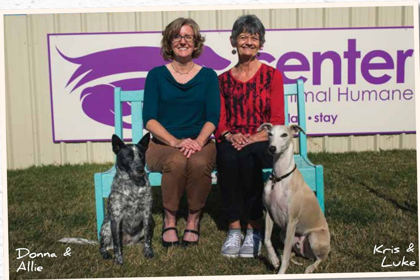
Allie, AKA - MACH Walkabout PAW's Lil Alligator RN, HSAS, PT, FDC, MXB, MJB, MXF, T2B, THDN, CGC Luke, AKA - MACH2 AHNM Luke MXG MJC OF T2B