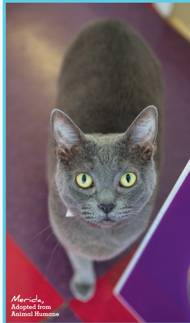
Merida, Adopted from Animal Humane