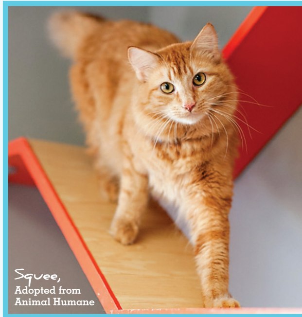
Squee, Adopted from Animal Humane