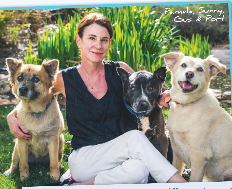
Pamela, Sunny, Gus & Port

My first pet entered into my life when I was 2 years old. When I was 8, we adopted our first rescue dog. Since that time, I've had only rescue pets in my life. Currently, my home is blessed with three dogs and one cat. My fabulous feline's name is Busy and my dogs are Gus — who survived the horrific experience of being a bait dog in a dog-fighting ring, Port — named after the portable building I found him under in Shiprock, New Mexico, and Sunny. Until recently, my life was blessed with a fourth dog named Velvet. After enriching my world for 12 years, Ms. Velveten Rabbit made her exit over the rainbow bridge in December.