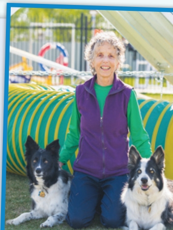
MaryMac, Target & Zoom