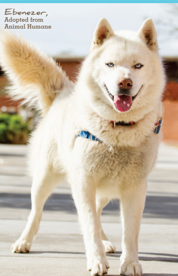
Ebenezer, Adopted from Animal Humane