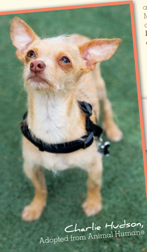
Charlie Hudson, Adopted from Animal Humane

Alone in a strange place, uncomfortable and scared, Charlie Hudson arrived at Animal Humane as part of a statewide Project Fetch transfer. We don't know his history, but upon his arrival at our Main Virginia Street Campus, we noticed immediately that the 6-month-old Chihuahua/Terrier cross was in pain and unable to use one of his hind legs. Because of your generous support, we had the necessary resources readily available to help this sweet little dog feel better and find a perfect family.