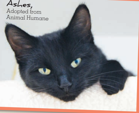
Ashes, Adopted from Animal Humane

Sweet Ashes — a beautiful 7-year-old surrendered to our shelter — is one of 1,500+ cats we'll place into homes this year. She left our care how most do, adopted from our Main Campus (or Westside Adoption Center); but over the years Animal Humane has developed some unique placement avenues for felines.