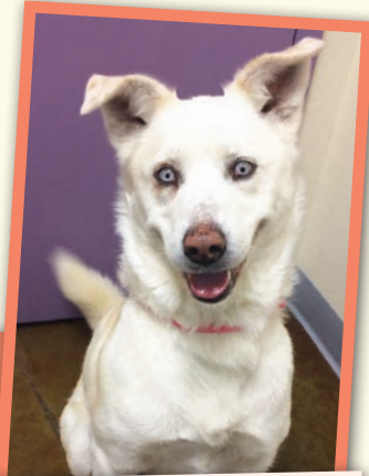
Tye, Adopted through Animal Humane Partnership