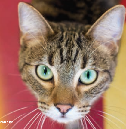
Millie, Adopted from Animal Humane