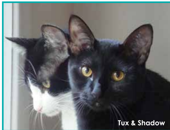
Tux & Shadow