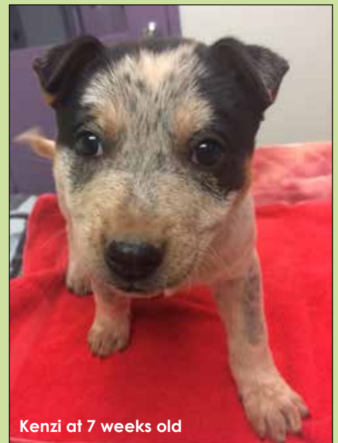
Kenzi at 7 weeks old

"Kay and I had rescued retired greyhounds before, but Kay wanted to try something new and suggested we go down to the shelter and adopt a local dog." Tim recalls. "After we described what we were looking for, they brought