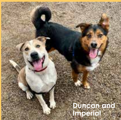
Duncan and Imperial

dog, lounging behind team members while they answered Behavior Helpline or Safety Net calls.