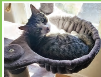
Loki is living his best life!