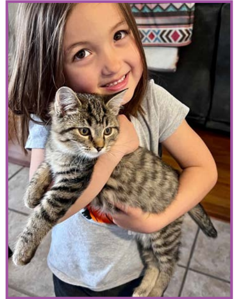
Fig has been the perfect addition to his new family! He loves getting his daily snuggles not just from his new humans, but his four-legged brothers and sisters.