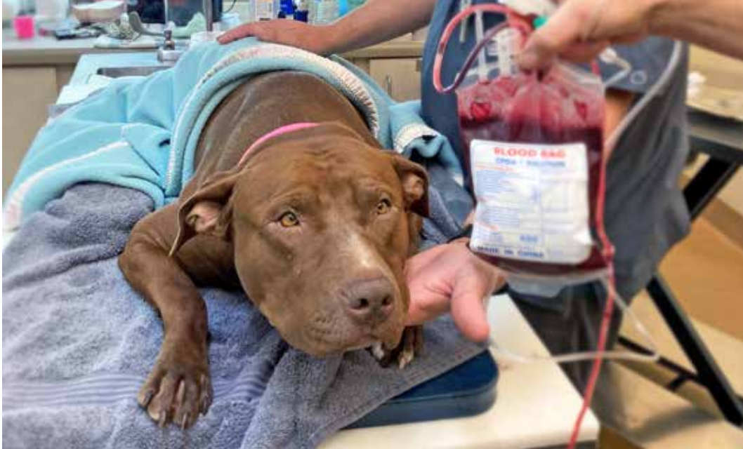
Fairy gives blood to save another pet in need,

and eager to please. She was phenomenal with other dogs, even new canine companions who were having a hard time adjusting to shelter life. As a result, our Behavior Team enlisted Fairy as a helper dog, which allowed her to interact with pets and ease their anxieties while they awaited adoption. Fairy clearly had a knack for helping out. All the pets she worked with eventually found families of their own — even as Fairy continued to wait patiently for a family of her own!