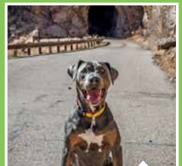
Good boy Yago is loving life on the westside! He's also quite the portrait model for his artistic parents.

Have you adopted a pet from Animal Humane?