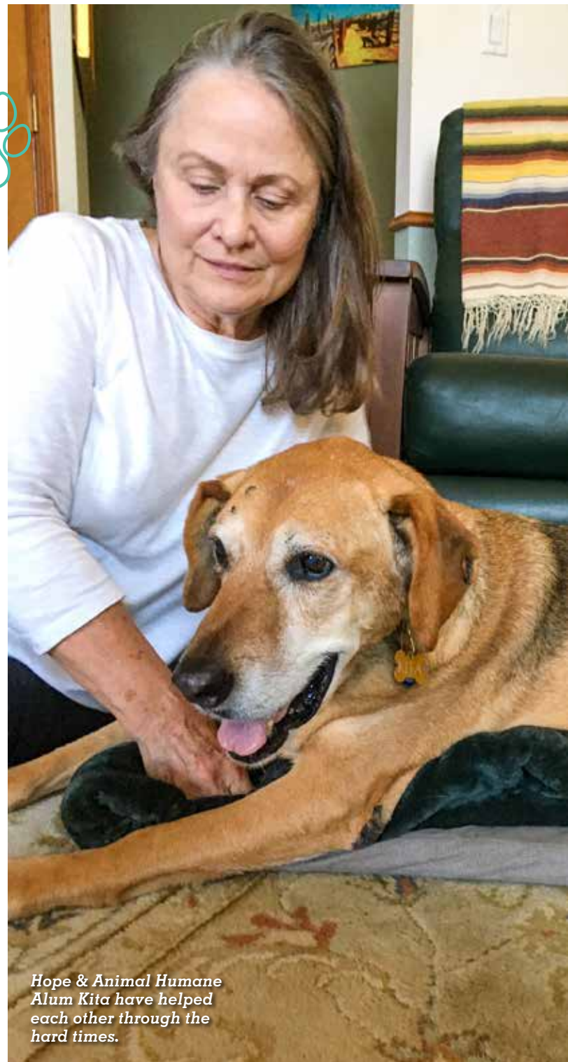
Hope & Animal Humane Alum Kita have helped each other through the hard times.

Through all the sadness and grief that followed, Kita kept me grounded, giving purpose to each day's routine. Her quiet calm helped ease the pain, and the wag of her tail and excitement when I'd return from work brought a smile to my face, bringing a sense of hope back into my life.