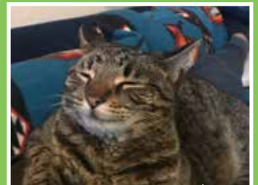
Wilma, at home & content while she indulges in some relaxation time.