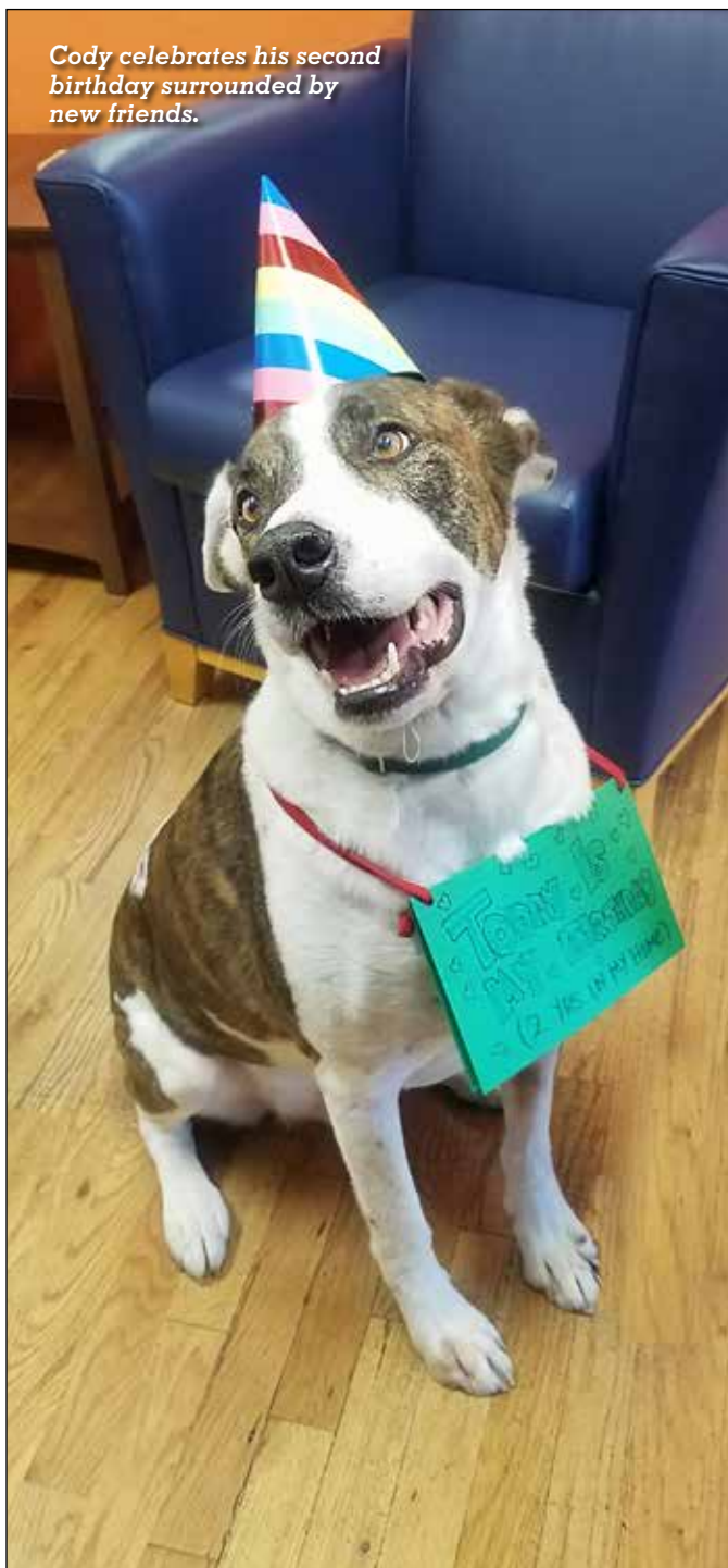
Cody celebrates his second birthday surrounded by new friends.

C ody, an American Pit Bull Mix, first came to Animal Humane after his original owners could no longer care for him. Although this sweet boy loved people and was eager to please, he had to wait for a family that could match his energy levels as well as his curious nature.