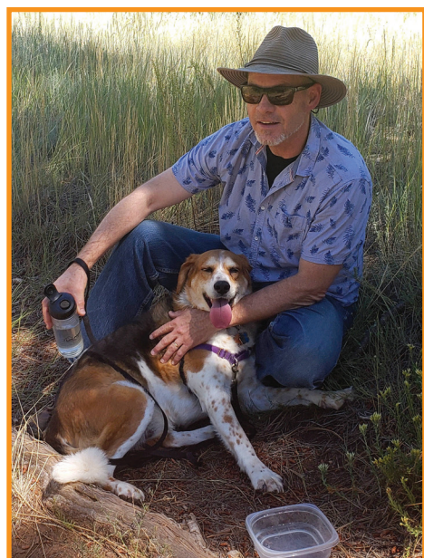
Hank celebrated his one year adopt-a-versary this past November!