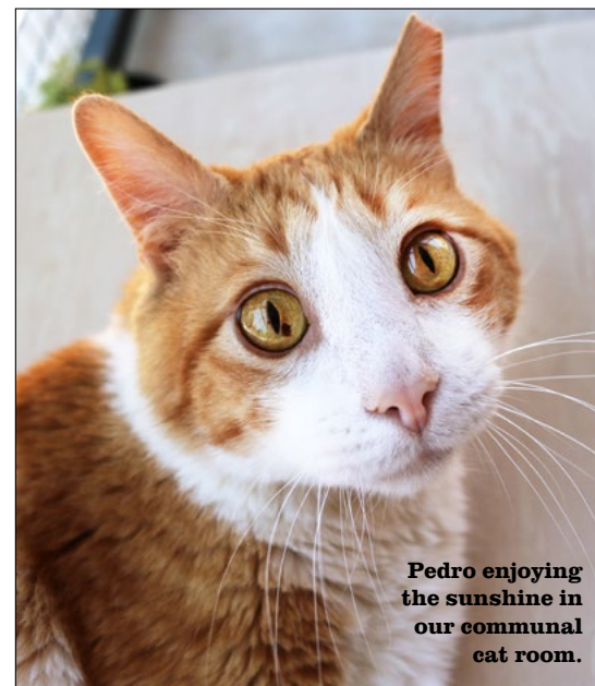
Pedro enjoying the sunshine in our communal cat room.