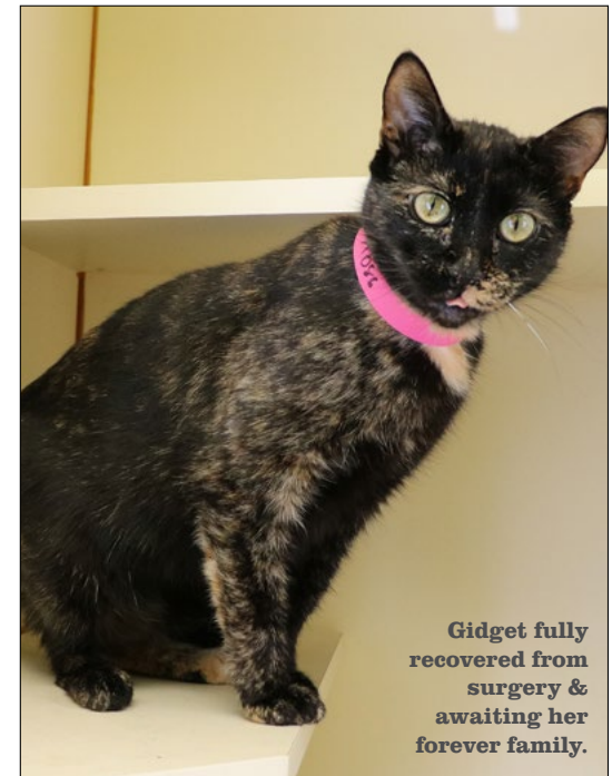
Gidget fully recovered from surgery & awaiting her forever family.

and aggressive antibiotics. Ten days later Gidget had fully healed and eager to take on her next adventure. The beautiful girl was adopted in no time and is living happily with her canine sibling.