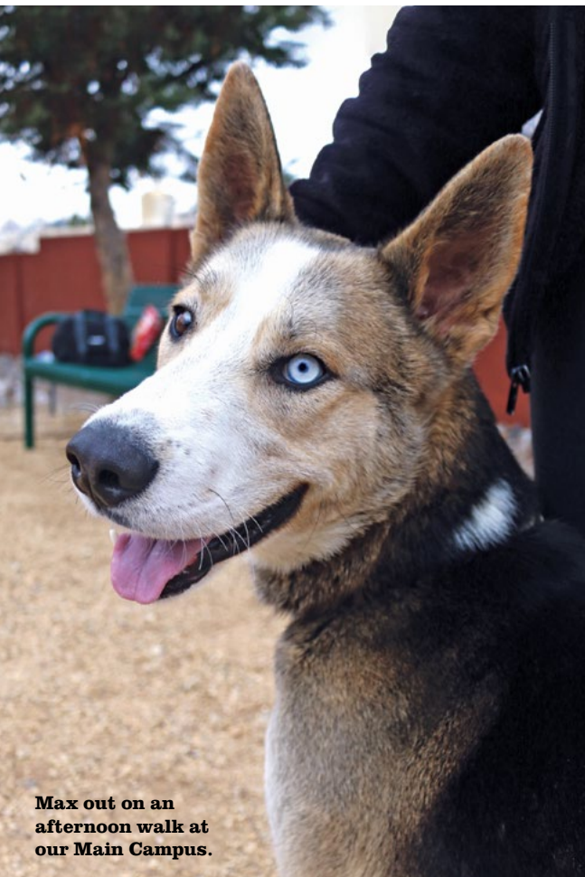
Max out on an afternoon walk at our Main Campus.