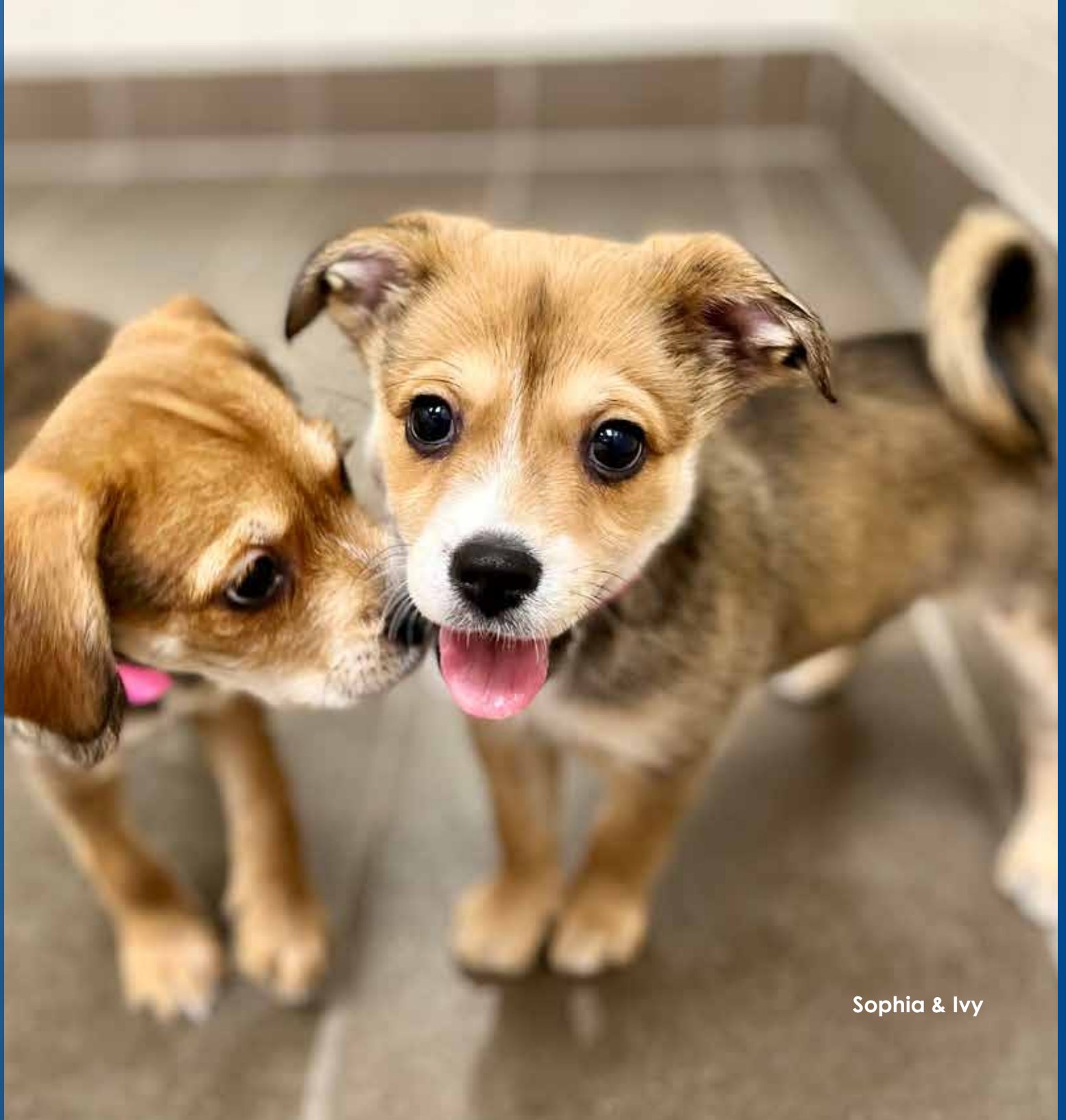
Sophia & Ivy

pets transferred in through Project Fetch this fiscal year