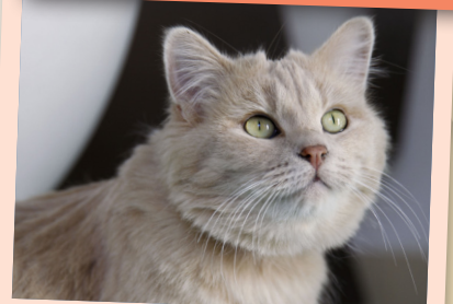
We achieved a 91% Live Release Rate.