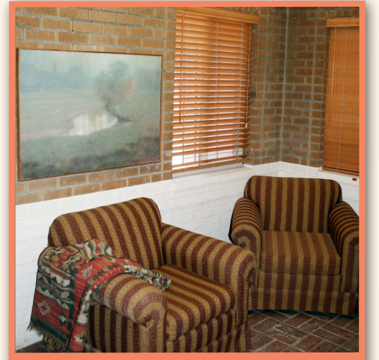
One of our new Comfort Rooms in our newly-expanded Donorsubsidized Veterinary Clinic

Our clients will experience peace and privacy when it is time to say goodbye to their beloved pets.