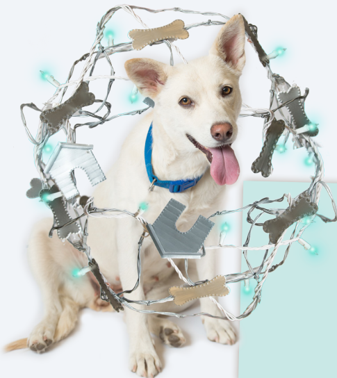
Bianca, Adopted from Animal Humane

This holiday season, you have the opportunity to double your impact on the lives of New Mexico's homeless pets!