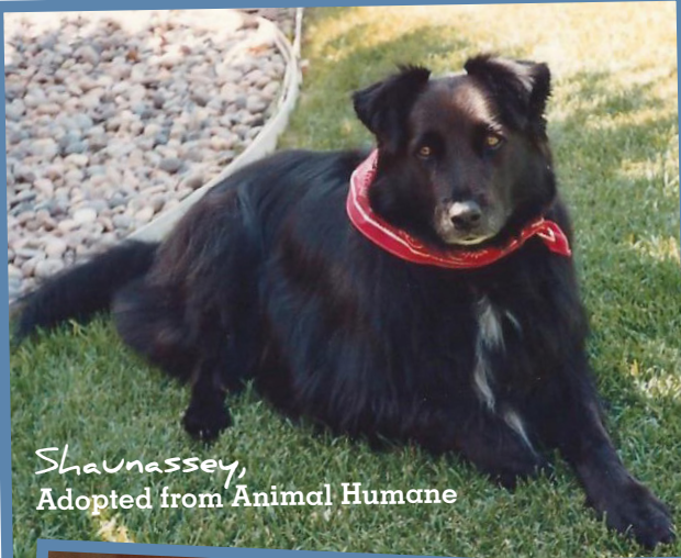
Shaunassey, Adopted from Animal Humane