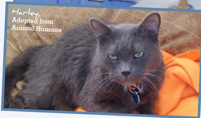
Harley, Adopted from Animal Humane