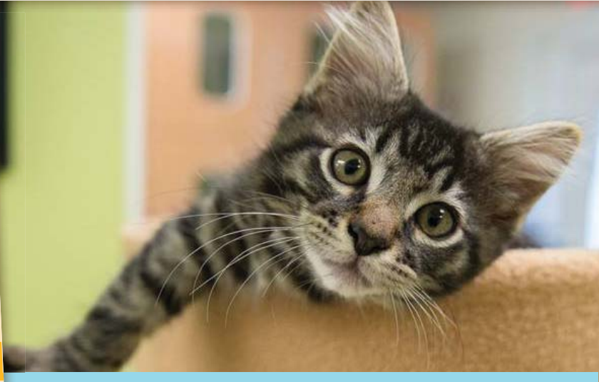
Our average LOS for kittens is 11-12 days.

Prince Edward, a Manchester Terrier mix puppy, was surrendered to Animal Humane from an unexpected litter in May. Edward arrived with four litter mates and his mother, who all spent several weeks in Foster Care while the puppies grew strong and healthy. When they were old enough, each was sterilized and made available for adoption. Prince Edward was adopted a short 4 days afterward! In fact, all of Prince Edward's siblings and his mother were adopted within 5 days.