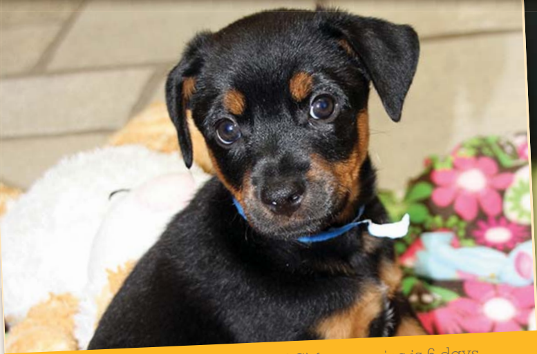
Our average length of stay (LOS) for puppies is 6 days.

There are many factors that influence a pet's length of stay at Animal Humane. Some pets require extensive medical care or behavior training, while others may be scared and a little wary of people initially. Each pet comes to us with a story and a temperament all their own, and sometimes it takes a little extra time to transition to the next chapter of their lives. Thanks to the generous funding of our incredible donors and the hard work of our Veterinary, Foster Care, Animal Care, Behavior, Adoption, Volunteer and Marketing Teams, we are able to minimize length of stay for our pets, find them wonderful homes, and transfer in more at-risk pets from throughout the state.