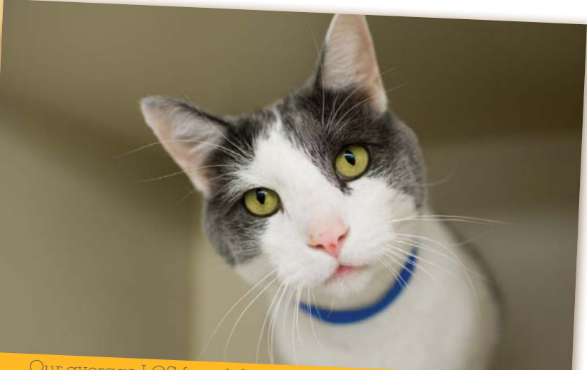
Our average LOS for adult cats is 14 - 15 days. Senior cats often arrive at Animal Humane after living most of their life with one person or family, so it occasionally takes more time to find these felines their perfect fit.

On the day that Oakley, a two-year-old American Pit Bull mix, arrived at Animal Humane in February, his owners were in tears. They had received military relocation orders and could not bring Oakley with them due to breed restrictions in their required military-base housing. They shared how wonderful Oakley was, and sadly released him into our care. Oakley was already neutered and became available for adoption immediately. Because of his easygoing temperament, he participated in many playgroups with dogs of all sizes. After only 18 days in our care, Oakley found his forever home, where he plays with his owner's grandchildren regularly and has many canine playdate partners.