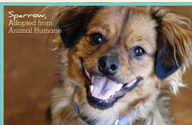
Sparrow, Adopted from Animal Humane