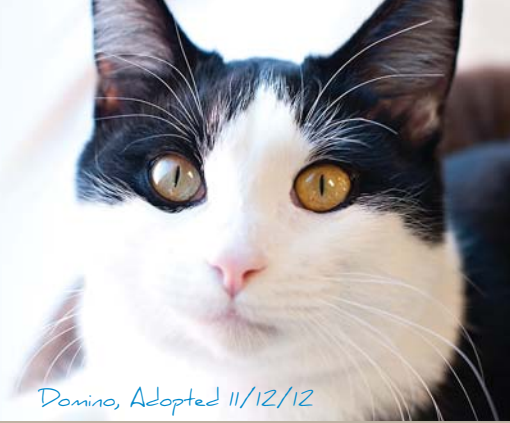
Domino, Adopted 11/12/12