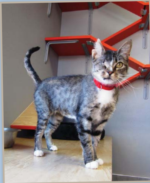
Honey Dew in the Robbie Jones Memorial Cat House