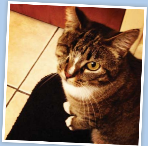
Honey Dew, now Socks, in her new loving home!