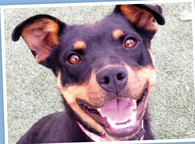
Fresno, a Foster2Home success!