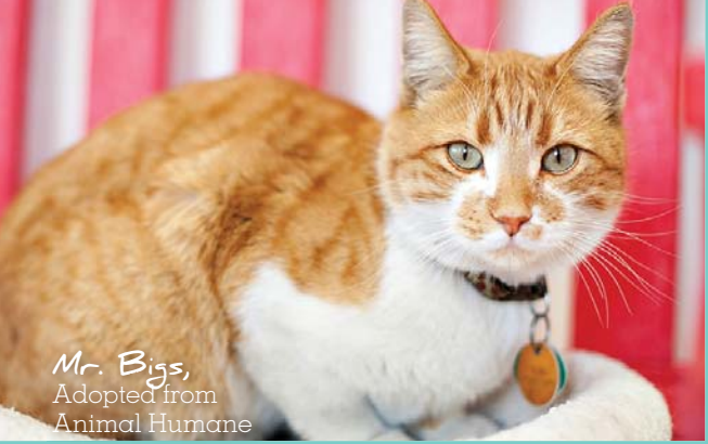
Mr. Bigs, Adopted from Animal Humane