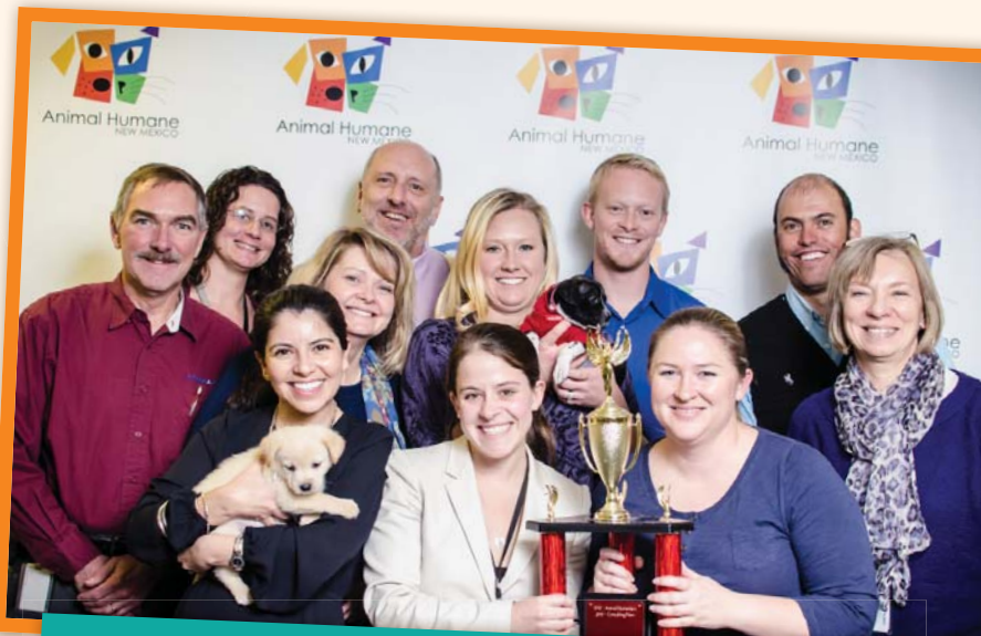
Doggie Dash & Dawdle's 2013 Top Fundraising Team "Consulting Paws" from Bohannon Huston