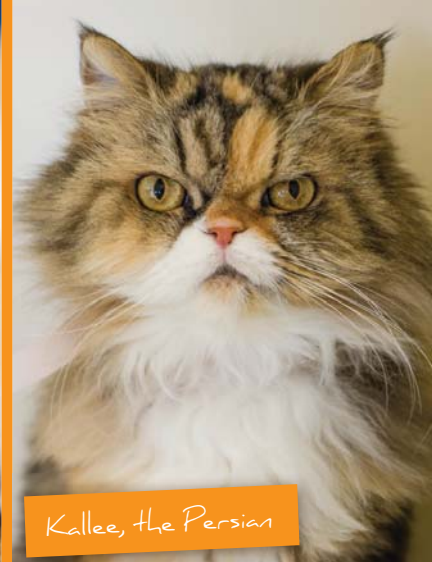
Kallee, the Persian