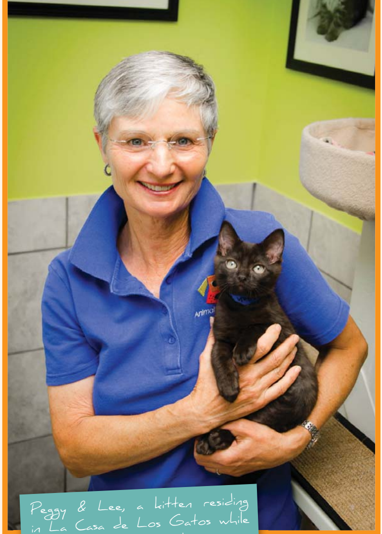
Peggy & Lee, a kitten residing in La Casa de Los Gatos while waiting for a new family

Thanks to you, our devoted donors, volunteers, adopters and friends. Animal Humane was voted Best Nonprofit Organization in the Albuquerque Journal's annual Reader's Choice Awards . Thousands of Albuquerque Journal readers voted for their favorite businesses in 96 categories—from sandwich to shoe store, from barber to bike path, from donut to dentist. Your passion for our life-saving work is overwhelming, and does so much for homeless pets every day. THANK YOU FOR THIS AMAZING AWARD!