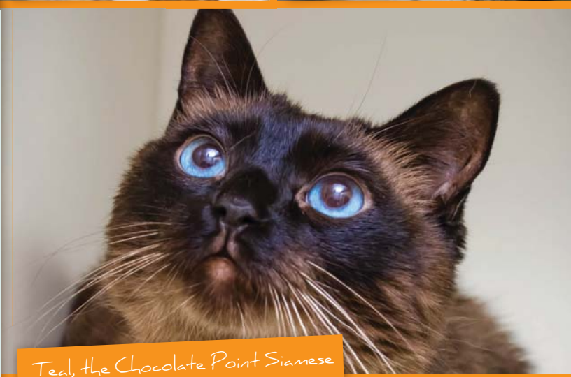
Teal, the Chocolate Point Siamese