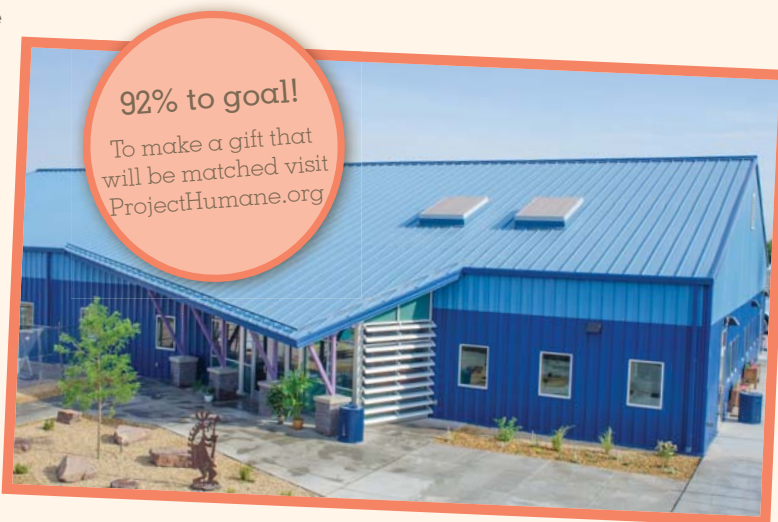
Big Blue, which opened in June 2013