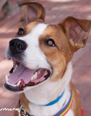
Toezy, Adopted from Animal Humane