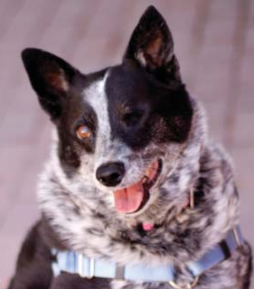
Roseanne, Adopted from Animal Humane