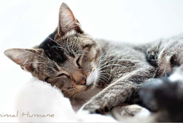
Angel, Adopted from Animal Humane