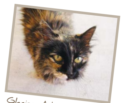
Glacier, Adopted 11/8/11

Our current annual report is available online. Visit our website to review what Animal Humane has achieved with your amazing support! Our report includes organization-wide accomplishments and financial summaries. Please note, in 2010, Animal Humane moved from a calendar budget cycle (January-December) to a fiscal year running July 1-June 30. Financials presented in our annual report cover an 18-month period, January 1, 2010-June 30, 2011. Future annual reports will cover a 12-month time frame from July 1 through June 30.