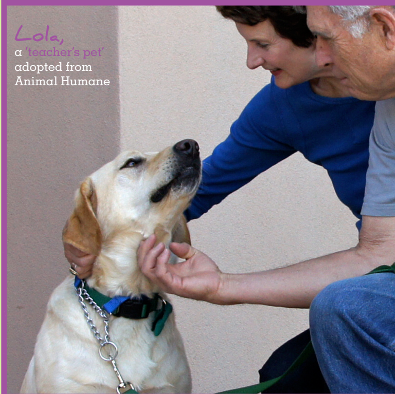
Lola, a 'teacher's pet' adopted from Animal Humane

"The MYM survey was a huge help! It led us straight to Bonnie, who has fit into our family & lifestyle seamlessly."