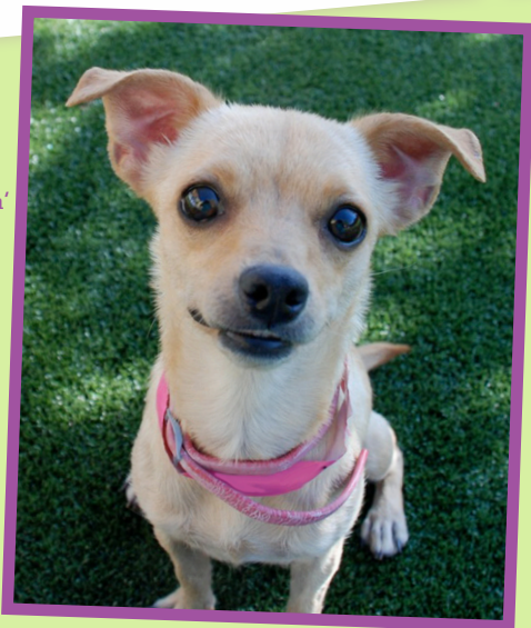
Bonnie, a 'constant companion' adopted from Animal Humane

Helping Adopters find their Perfect Canine Match