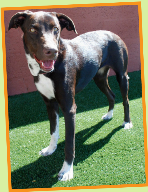
Brownie, a 'free spirit' adopted from Animal Humane

MYM MEET YOUR MATCH® A PROGRAM OF THE ASPCA ®