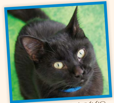
Shadow, adopted 7/1/10