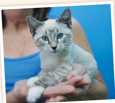
Sly, adopted 10/26/10