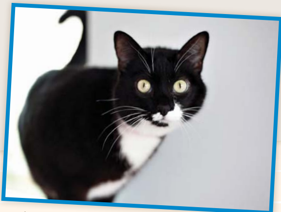
Henrietta, adopted 9/8/11