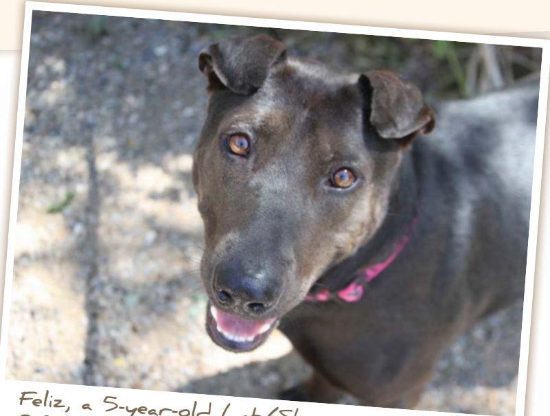
Feliz, a 5-year-old Lab/Sharpei mix, was one of 22 pets transferred from Santa Fe to help evacuees displaced by 2011 wildfires.

Since 2009, 1,976 pets' lives have been saved through our Project Fetch program. Less fortunate shelters across New Mexico count on Animal Humane to save the lives of the pets they cannot. Pets are transported to us on a weekly basis as space permits so our adoption team can find them new homes. Donations in support of this work extend far beyond Albuquerque's boundaries benefitting shelters from Roswell to the Four Corners area.