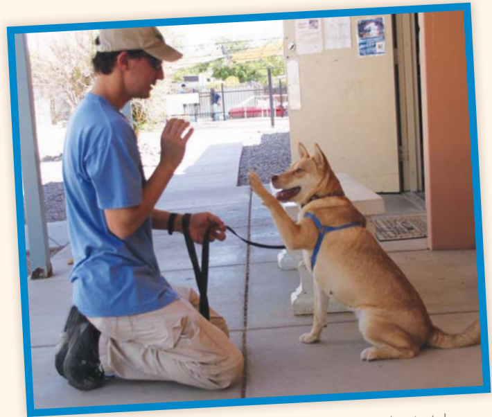
Volunteer working on manners with pet resident, Llana

Our behavior team contributes to the well-being of pets in our community every day. From teaching life skills to shelter dogs, to socializing fearful cats and training volunteers on safe pet handling, our team helps homeless pets in need. Their expert advice to over 500 pet owners calling our free Behavior Helpline (505.938.7900) is working to solve behavior problems thereby preventing countless owner relinquishments. By providing Train Humane™ obedience and agility classes, our staff teaches the benefits of positive, rewards-based dog training that provides a successful foundation for a lasting partnership. All of these efforts contribute to our low adoption return rate of 6%.