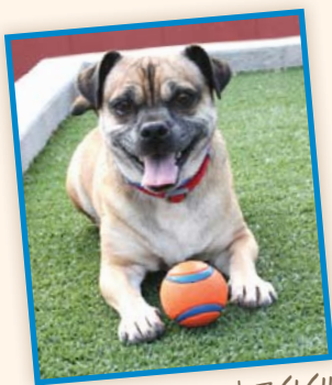
Fred, adopted 7/1/11, plays ball in our dog park.