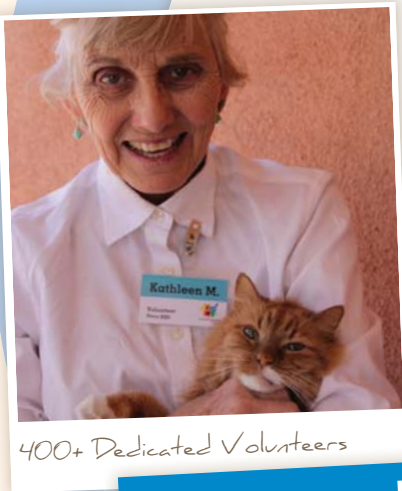
400+ Dedicated Volunteers